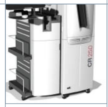
CR 25.0 can easily be placed at any location, even in combination with the CR User Station.