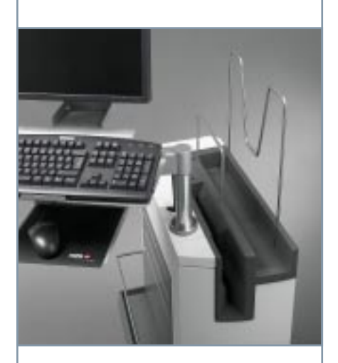
Integrated CR User Station for time-saving identification and optimized workflow