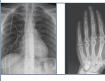
For a broad range of applications

Small footprint digitizer for a unique range of clinical applications