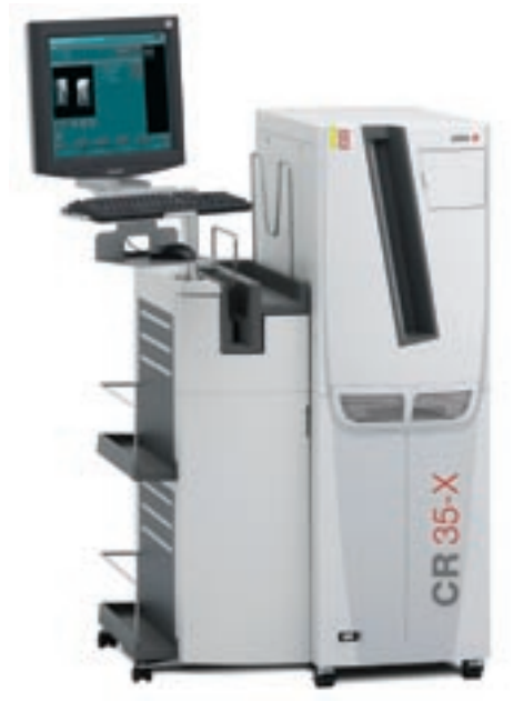
CR 35-X can easily be placed at any location, even in combination with the CR User Station.