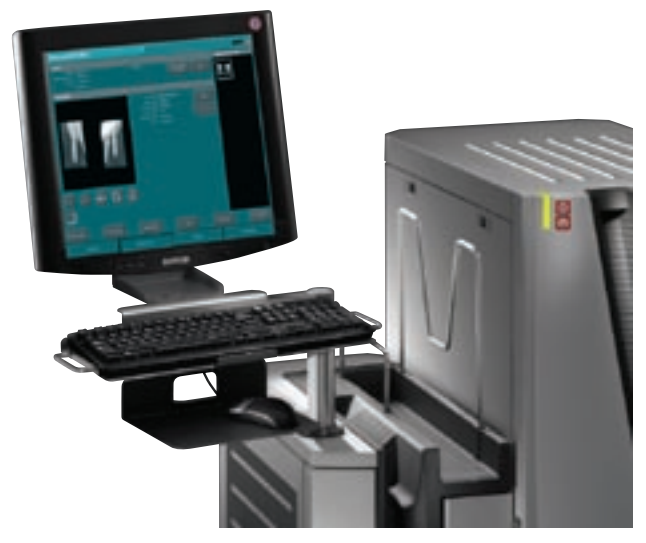
Integrated CR User Station for time-saving identification and optimized workflow.